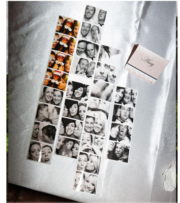
Photo booths are great fun and will keep your guests entertained. However all the photos are basically the same, guests doing crazy things with props against a back drop. Does this show your reception? Is this how you want to remember all the hours you spent planing it?

QR codes are a great way to get your guests to send you their photos, however most guests will only send you photo's of you cutting the cake ( which you will have a million off all the same) or they will be selfies of them and their friends, not really showing you the reception.